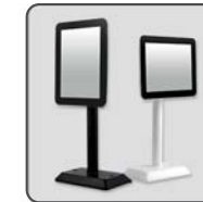
9.7" Pole Display