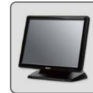
15" Touch Monitor