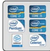
Compatible with Various CPUs