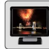
Industrial LED Display