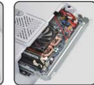
Easy Access to Motherboard (TITAN-500)