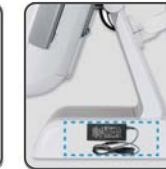
Built-in Power Adaptor