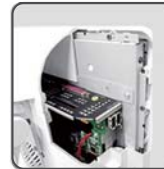
Solid Al Frame Construction (TITAN-500)