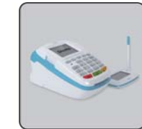
EFT POS Terminal