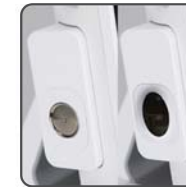
Dallas Key / Finger Print Reader