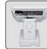
Upper I/O Panel for Easier Control